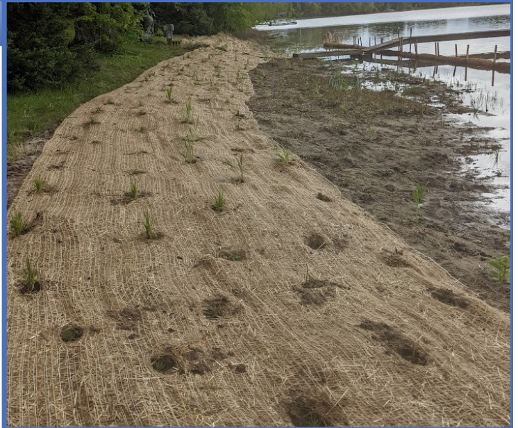
Project area. Installed June 2022.

Fawn Lake is a high quality lake with a small watershed, so shoreline practices are important to maintaining its good condition. ACD provided project administration, design services, and project installation.